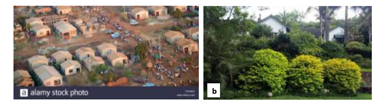
Fig. (1). shows a) high-density layout versus b) low-density suburb house in Zimbabwe.

Demographics and clinical data recovered from Harare patients suspected to be suffering from typhoid were noted. Isolates from stool and blood samples, for the confirmed cases, received during the period from January 2016 to April 2016, were retrieved. The Mueller–Hinton agar disk diffusion method was subsequently used to determine antimicrobial susceptibility profiles of the 35 confirmed S. Typhi isolates against ciprofloxacin (Fig. 2b ). Results were interpreted according to Clinical and Laboratory Standards guidelines (Table 1).