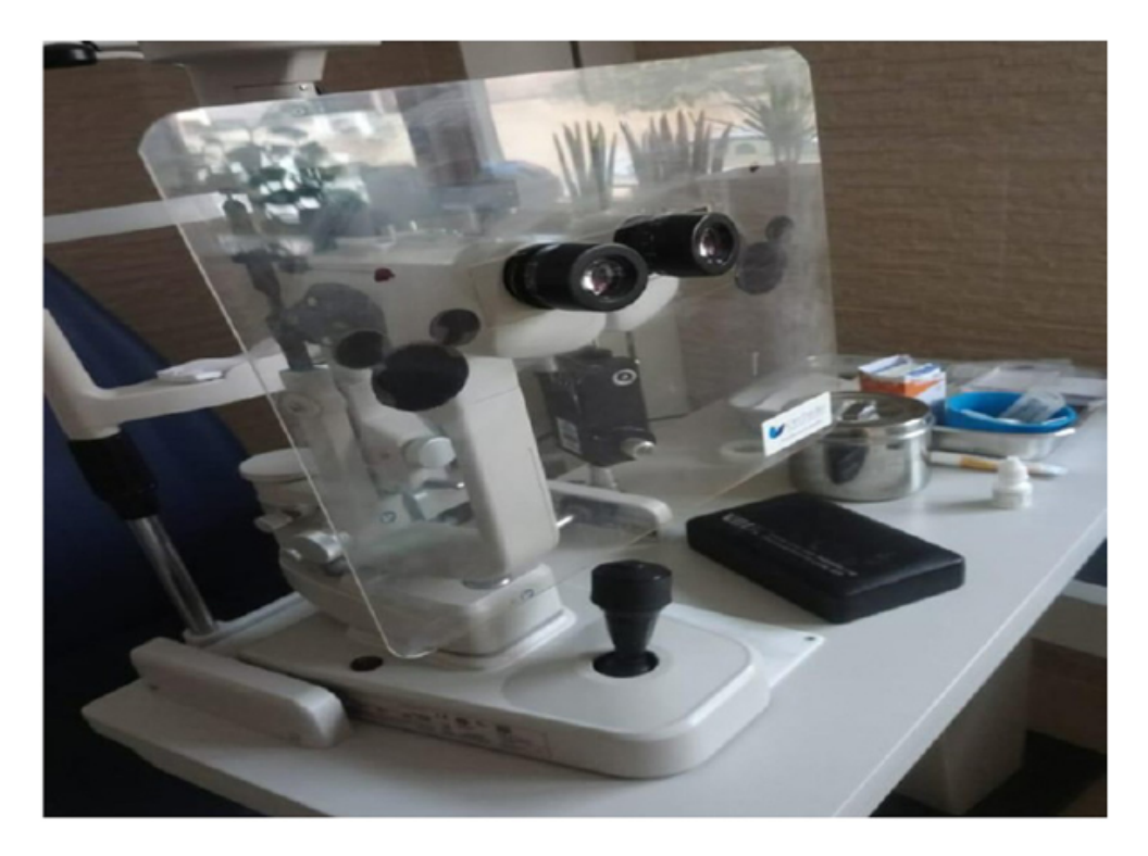
Fig. (3). Protective Plastic Shield in Slit Lamp.