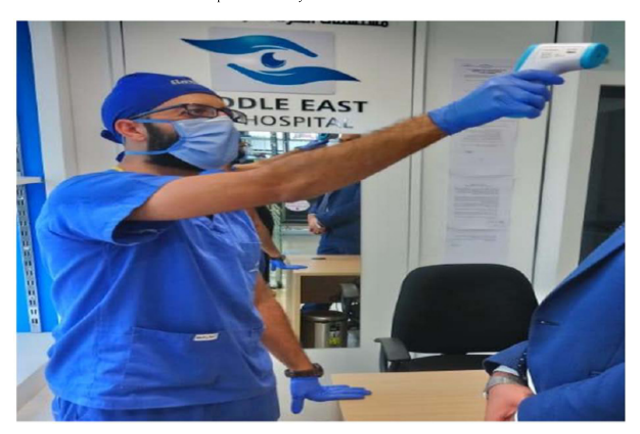
Fig. (4). Measuring Temperature Remotely.

In order to make our practice clear, a workflow was developed. This workflow describes our procedures for patients who need elective surgery during the pandemic, as shown in Fig. (5). All patients in need to be admitted into the hospital were prepared for the surgery on the same day to decrease the risk of cross-contamination.