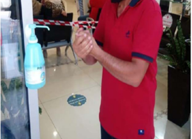
Fig. (2). Distribution of Hand Hygiene Gels.