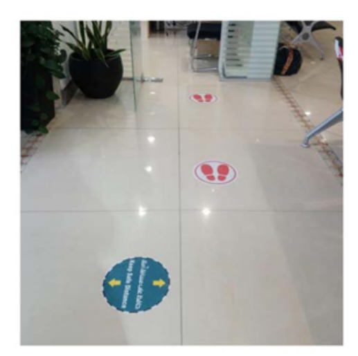
Fig. (1). Reminders for Social Distancing.

to be used according to working areas or care steps. Table 1 summarizes the use of hand hygiene and PPE in our center.