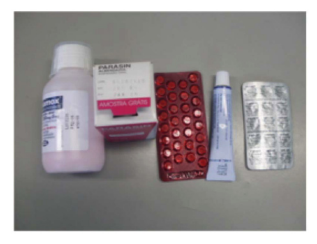
Fig. (3). Drugs used in training.

visited; this applied to all visits made by agents within the period. In addition, the drugs that were collected were not subject to any filters with respect to therapeutic class or packaging. Collection of the unused drugs was performed via the direct intervention of the CHAs during their routine visits. During the visit, they asked residents to show the agents where the drugs were stored and identified and collected those that were no longer required, regardless of whether the expiration date had passed. Oral informed consent was obtained from the study participants, as there was an unavoidable risk of breach of privacy.