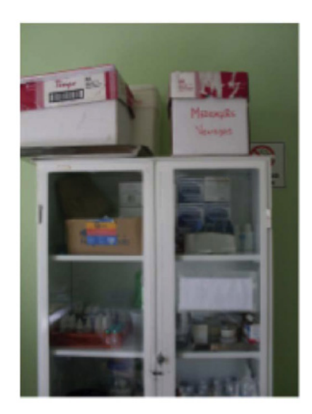
Fig. (4). Stores of medicines collected by agents, located at the family health strategy headquarter.

Following the visits, the agents returned to the Family Health Strategy headquarters at Vila Bras and were told to pack the material collected (Fig. 4) and place it in an on-site location to which only the agents and the unit staff had access.