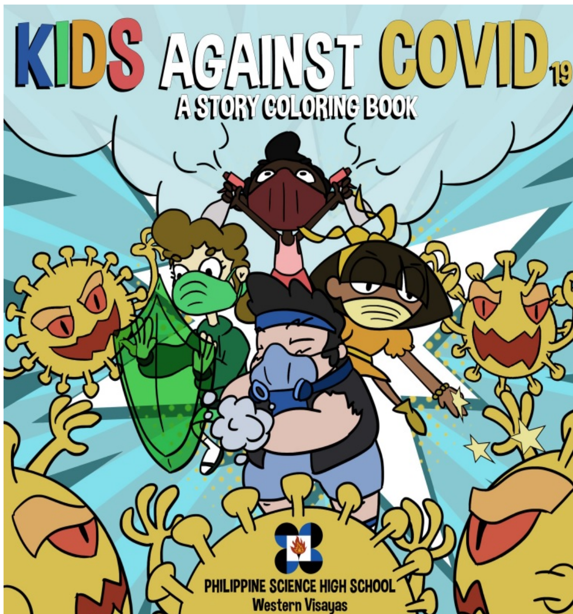
Fig. (2). The cover page of a story colouring book developed by the Philippine Science High School students generally available to the public in various Philippine and Asian languages.

As of the publication of this piece, the Centers for Disease Control and Prevention (CDC) of the United States government [14], the European Commission [15], and the Department of Health [16] of the Australian government, among others, have established multilingual educational resources for the migrant minority populations of their respective countries (Fig. 2).